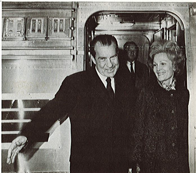
President and Mrs. Nixon wave a goodbye as they board a Metroliner special in Washington for the speedy run to Philadelphia. The Presidential trip gave a needed lift to rail travel. Members who wish to personally commend the chief executive for bringing trains into the national spotlight should address communications to: The President, The White House, Washington, D.C.